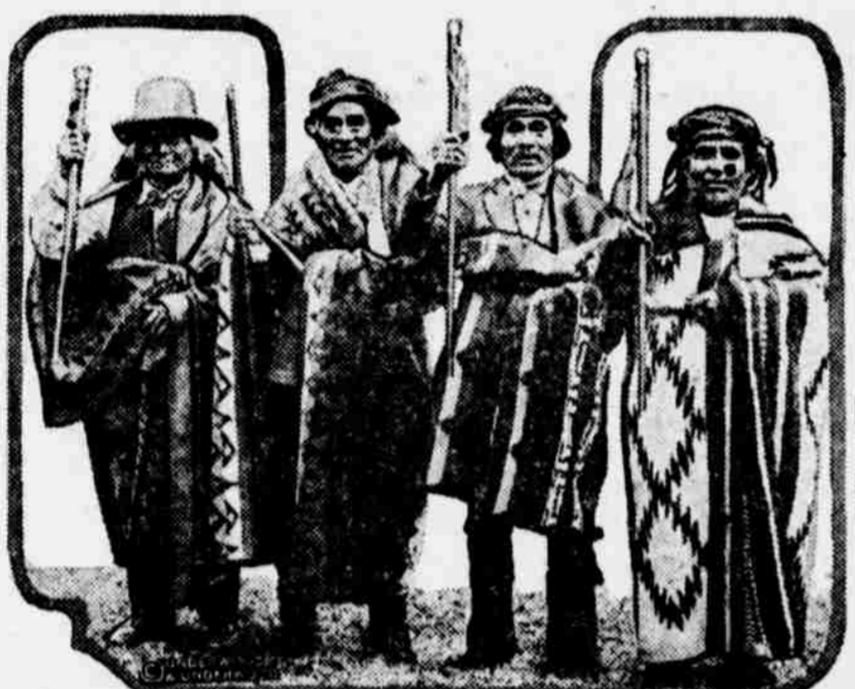
A picturesque delegation of Pueblo Indians arrived in Washington from New Mexico to plead with congress against the destruction, as they allege, of the very lives of their people through enforced starvation and disease. It is the first delegation of its kind to appear in the capital since the days of Abraham Lincoln, who presented each of them at that time with a cane as a token of his promise, they declare, of the permanent retention of their lands. The Bursum bill, which they are fighting, would deprive them of their fast dwindling lands. The Indians are shown carrying the Lincoln canes.