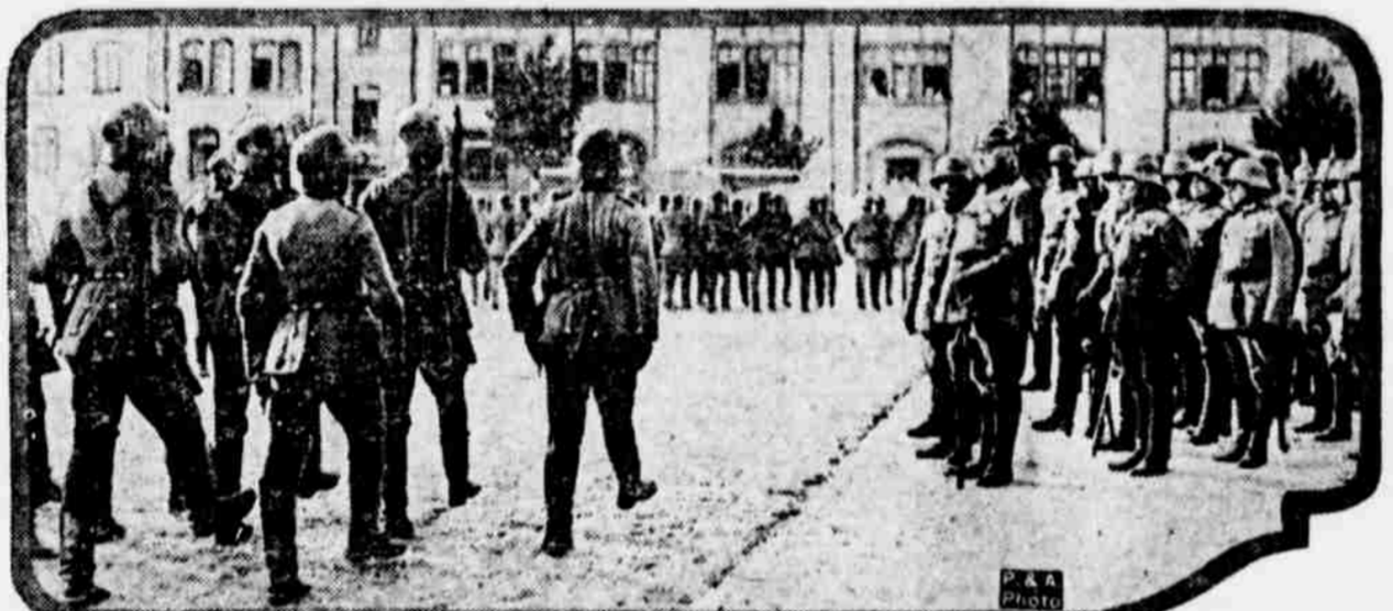
Germany's reichswehr or national police is a large and completely armed body of trained soldiers and there have been reports that it was being mobilized to resist forcibly the occupation of German territory by the French. The illustration shows a recent reichswehr demonstration in Berlin which Von Hindenburg reviewed.