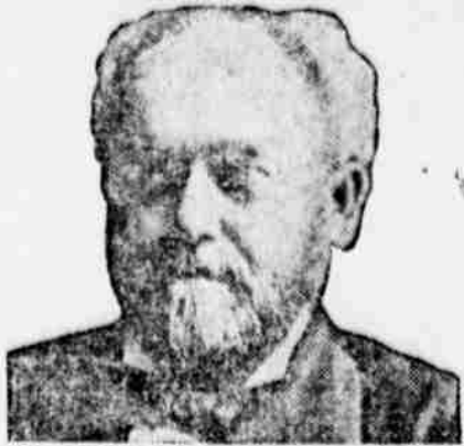
A MAN WHO BECAME FAMOUS