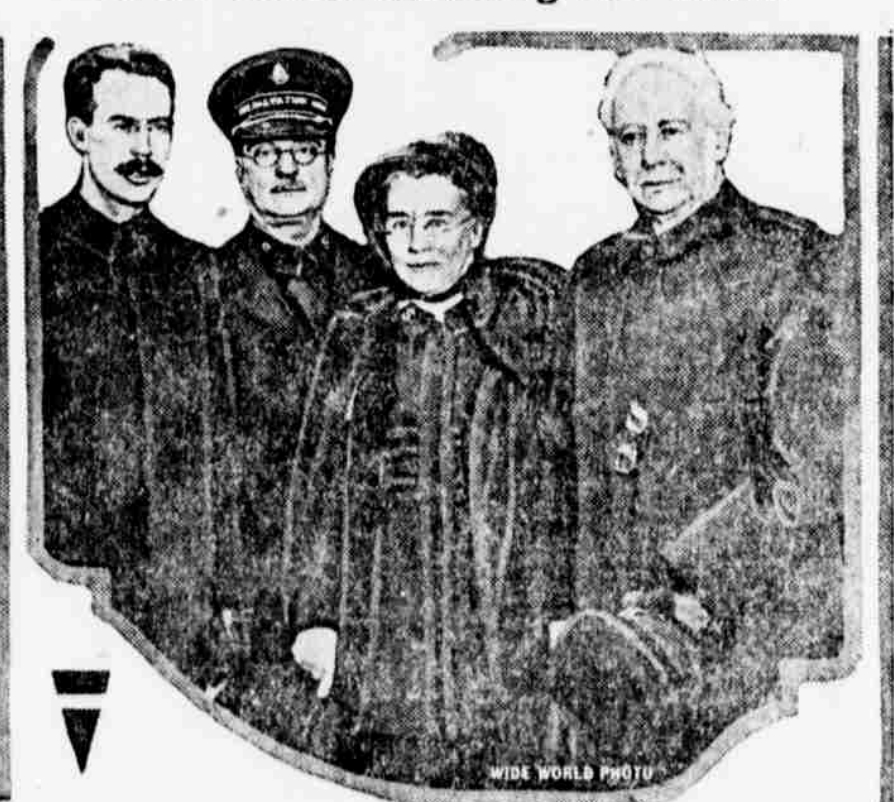
Gen. Bramweff Booth and Mrs. Booth leaving London for a tour of India and Ceylon to extend the usefulness of the Salvation Army in the remote parts