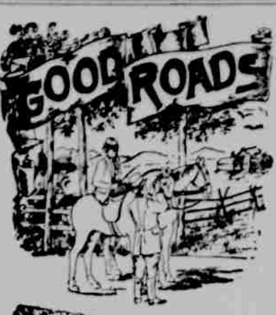
Good Roads Logic.

Good company and good discourses are the very pillars of virtue.—Izaak Watts.