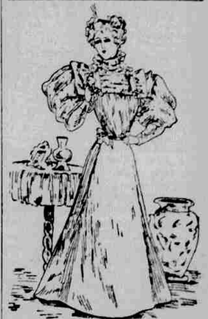
ANOTHER EXAMPLE IN ORGAN PIPE FOLDS.

The final costume that the artist contributes is made from heliotrope velours garnished with spangled dahlia velours. Its skirt is laid in three organ-pipe folds in back and is quite plain. The waist has fitted lining and fastens at the side, the front having no darts and hanging over the belt of spangled velours, which is trimmed