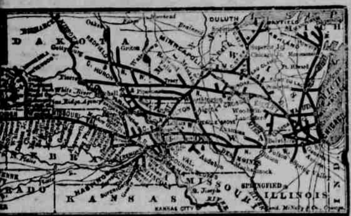
Map of the Elkhorn System.

is still a large amount of GOVERNMENT LAND open to entry in