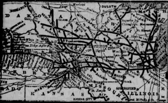
Map of the Elkhorn System.

is still a large amount of GOVERNMENT LAND open to entry in