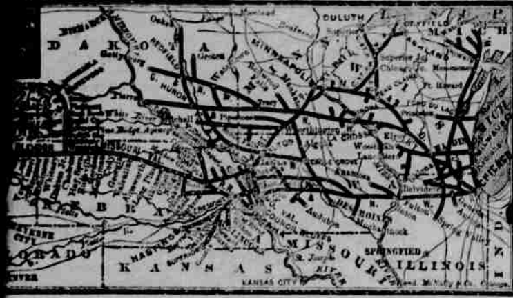
Map of the Elkhorn System.

There is still a large amount of GOVERNMENT LAND open to entry in