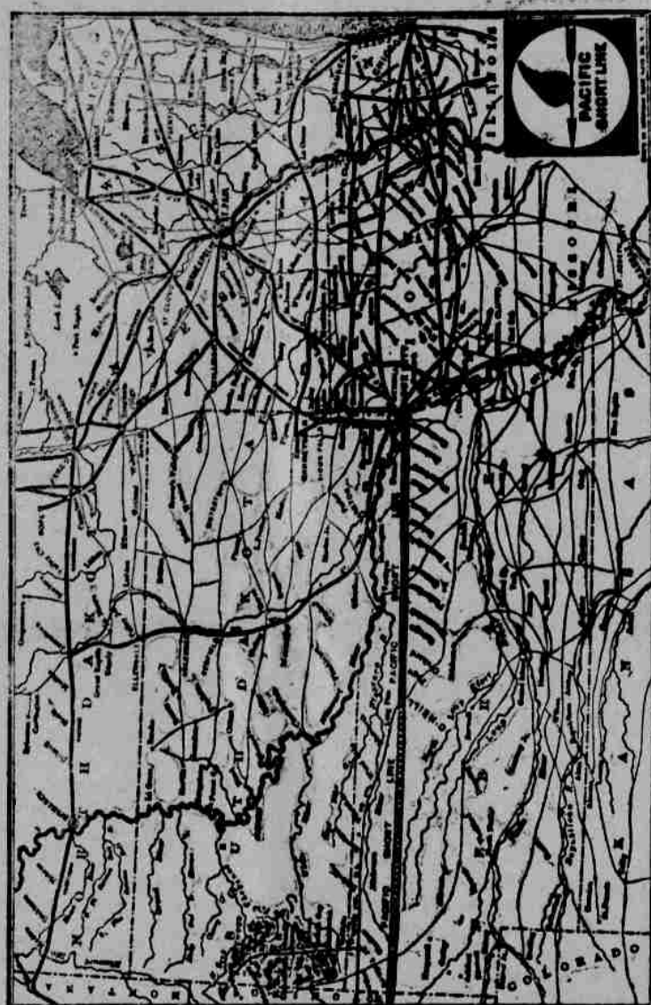
Map of Pacific Short Line and Connections.