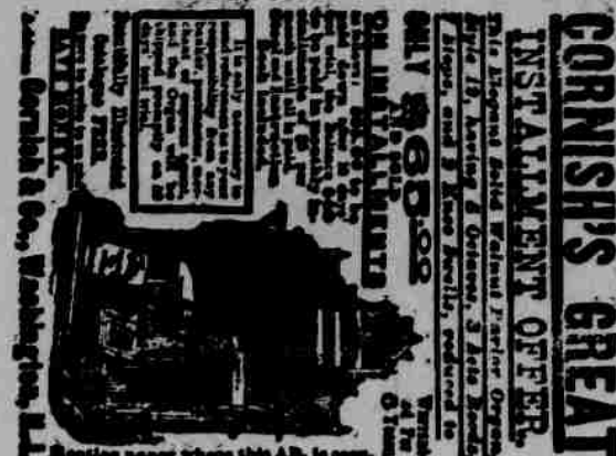
See the paper where this ad. is seen.

The B. & M. crosses the southeast part of the county and has 15 miles of its line within the borders of Sioux county. This road brings down the coal from the