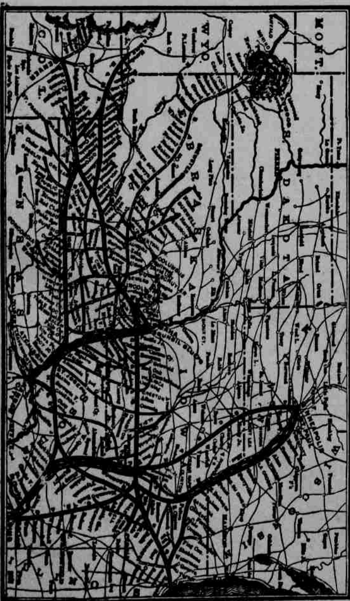
Map of the Burlington Route

This, alone, makes it possible for a man to improve a piece of land with a much smaller outlay of cash than he could have done in other parts of the state.