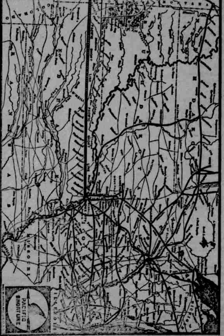
Map of Pacific Short Line and Connections.

CORRESPONDENTS: KOUTSEE BROS., New York City FIRST NATIONAL BANK, Omaha. BANK OF CHADRON, Chadron, Neb.