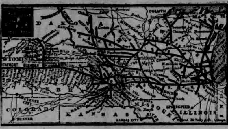
Map of the Elkhorn System.

There is still a large amount of GOVERNMENT LAND open to entry in