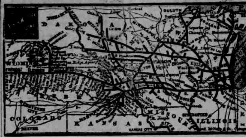
Map of the Elkhorn System.

There is still a large amount of GOVERNMENT LAND open to entry in