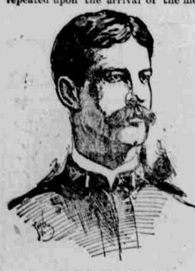
LIEUT. HOBSON. (The hero of the Merrimac.)

The same scenes of enthusiasm were repeated upon the arrival of the men