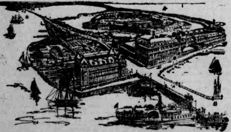
OLD POINT COMFORT AND FORTRESS MONROE, SHOWING HOTELS.