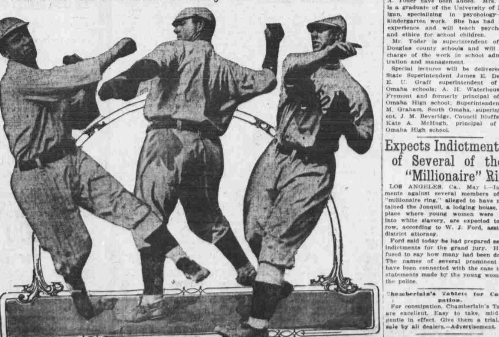
LEFT TO RIGHT—LARRY GARDNER, 25; HEINIE WAGNER, 28, AND MANAGER JAKE STAHL. Manager Jake Stahl of the world's champion Boston Red Sox is entirely satisfied with the outlook for 1913. All of his men are in the pink of condition and he declares the players have improved above their form of 1912.