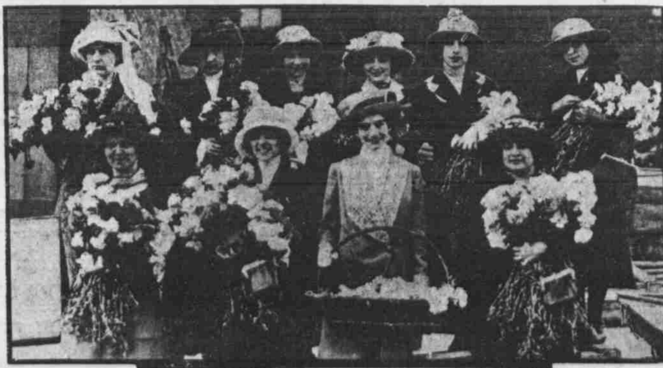
ONE HUNDRED YOUNG WOMEN EXHAUST THEIR SUPPLY OF FLOWERS EARLY—WILL SELL ON TWO MORE SATURDAYS.