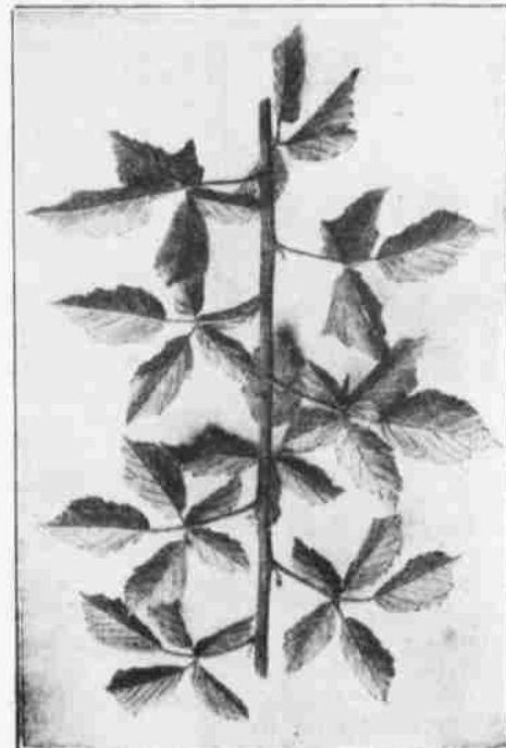
Smooth Cane of the Thornless Blackberry

cessful as at first hoped for. And it stands as another proof of the forces of evolution in plant development—an other object-lesson of how they may be employed, almost at will by man.