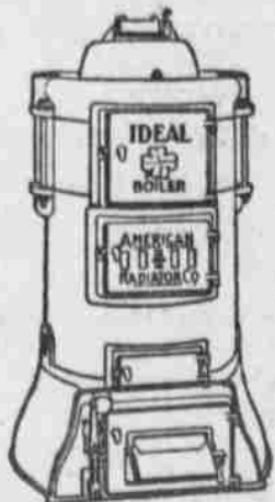
IDEAL Boilers are safer and easier to run than stoves, and their cleanliness reduces housework one-half. They will last as long as the building and need no repairs. Accept no substitute.

If ready to say "good-bye" to the old-time heating ways (or will soon build) you should have book (free): "Ideal Heating." Tells big heating facts you ought to know.