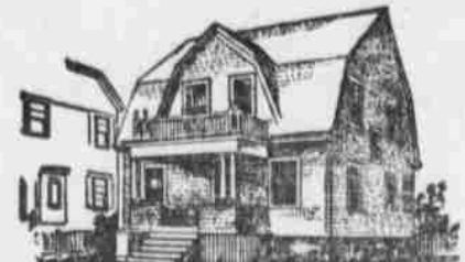
A No. 22 IDEAL boiler and 240 sq. feet of 28-inch AMERICAN Radiators, costing the owner $1385, were used to heat this cottage. At this price the goods can be bought of any reputable, competent fitter. This did not include costs of labor, pipe, valves, freight, etc., which are extra and vary according to climatic and other conditions.

To peacefully occupy, to profitably rent or sell a home the heating must promise sure comfort and economy. Many a well-built, well-lighted, well-located house to which tenants have rapidly said good-bye only needs to "put on airs"—warm, radiant airs from an IDEAL Boiler and AMERICAN Radiators—to have and to hold contented tenants or to find a quick purchaser.