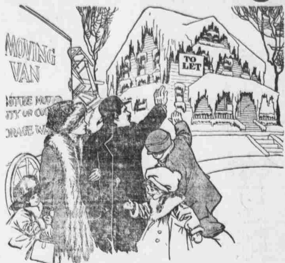
"Good-bye, old ice box!"

A cold house, like a cold man, is left behind. It is not the house any more than the man which repels. It is the unexpected streak of cold air within and about both which puts would-be tenants and friends in retreat. For such houses there is a never-failing remedy in