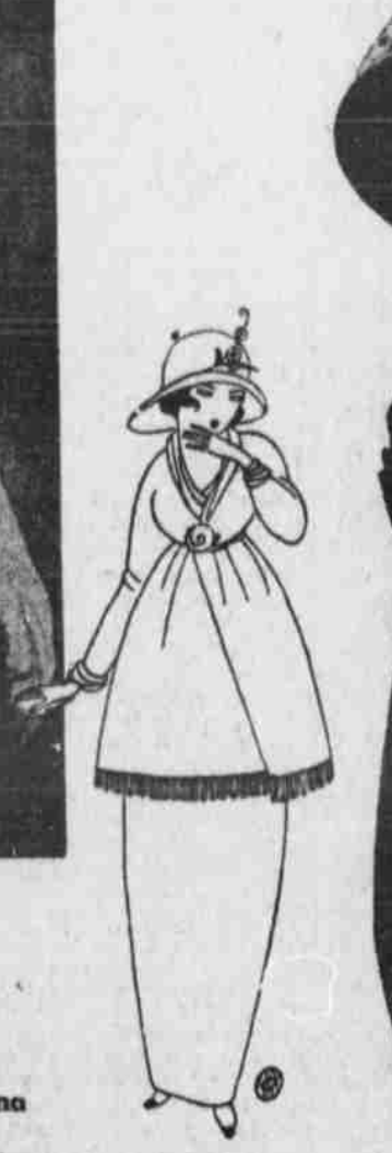
Skull-Cap Hat with the New Fountain Plume. The New Dalmatian Cuffs and Swan's Down Neck Trimming

lat Hats and Fountain Plumes Lady Duff-Gordon Describes the Skirts, Hats and Head-Dresses That Paris Will Favor During the Early Spring Season