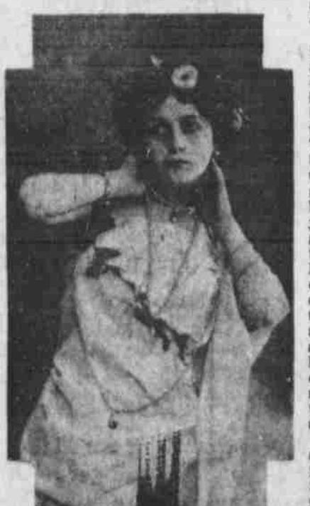
Vime. Lina Cavalieri.

Cleanliness within means cleanliness without, a clear interior a clear