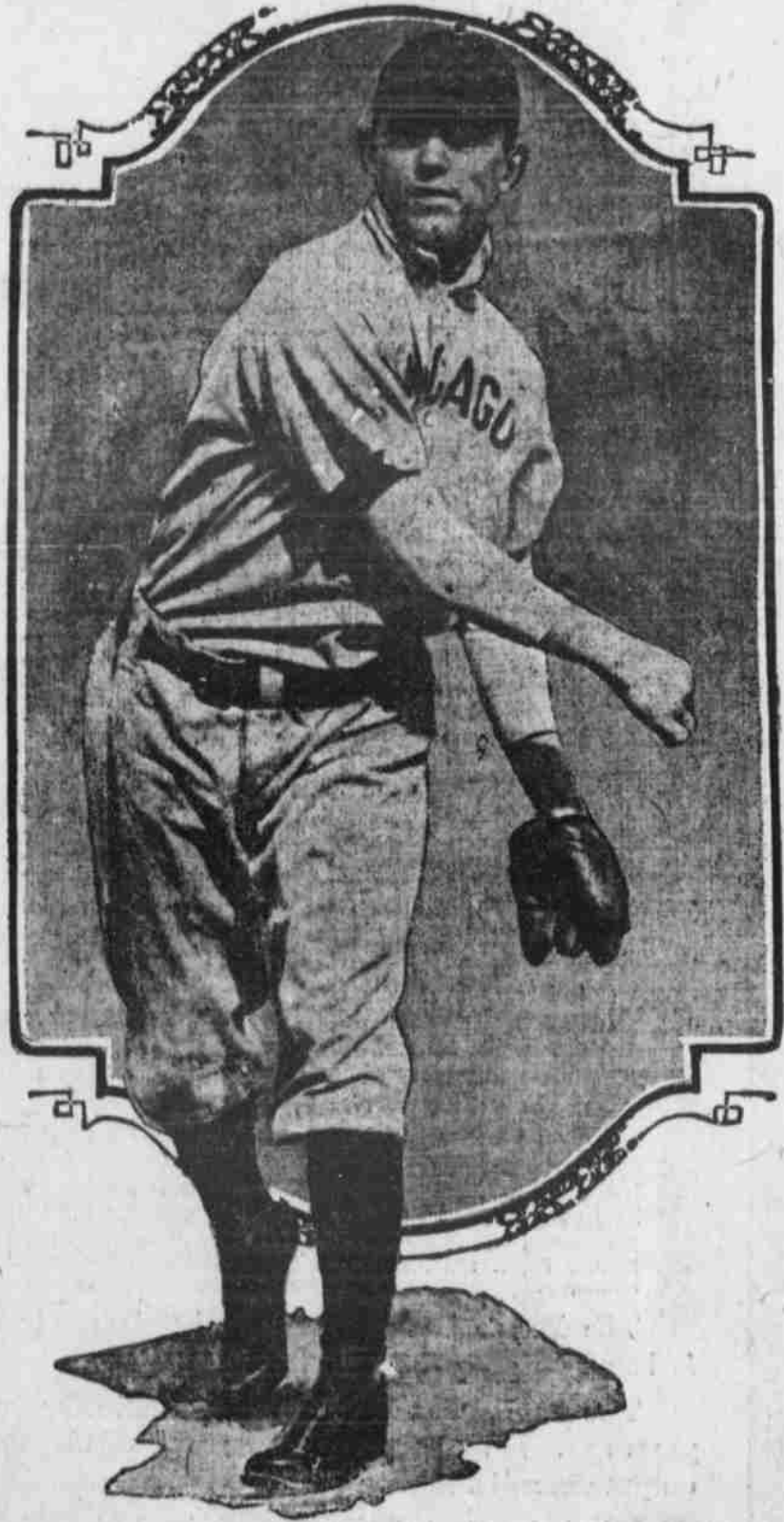
Ed Reulbach, the veteran of the Chicago Cubs' pitching staff, who has returned his contract for 1913 signed. Manager Evers expresses the opinion that Reulbach will be an effective twirler for a few more seasons and predicts that he will be as good as ever in 1913.