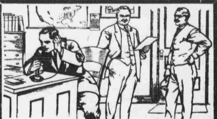
"We must have it tomorrow—we can't wait."