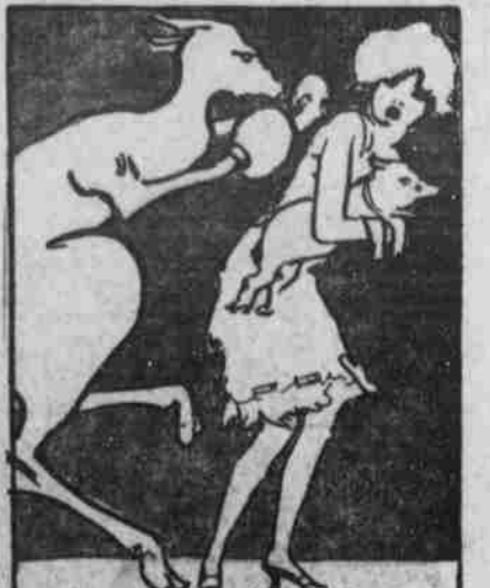
"The boxing kangaroo frightened Polaire's pig half to death."

If tact is able to keep this tantalizing trio of temperaments working harmoniously together for even part of a season, it will indeed be a triumph. But many husbands and theatrical managers, who have failed dimly in their efforts to gratify the whims of only one artistic woman, declare that Mr. Gest might as well try to bring the moon to Broadway.