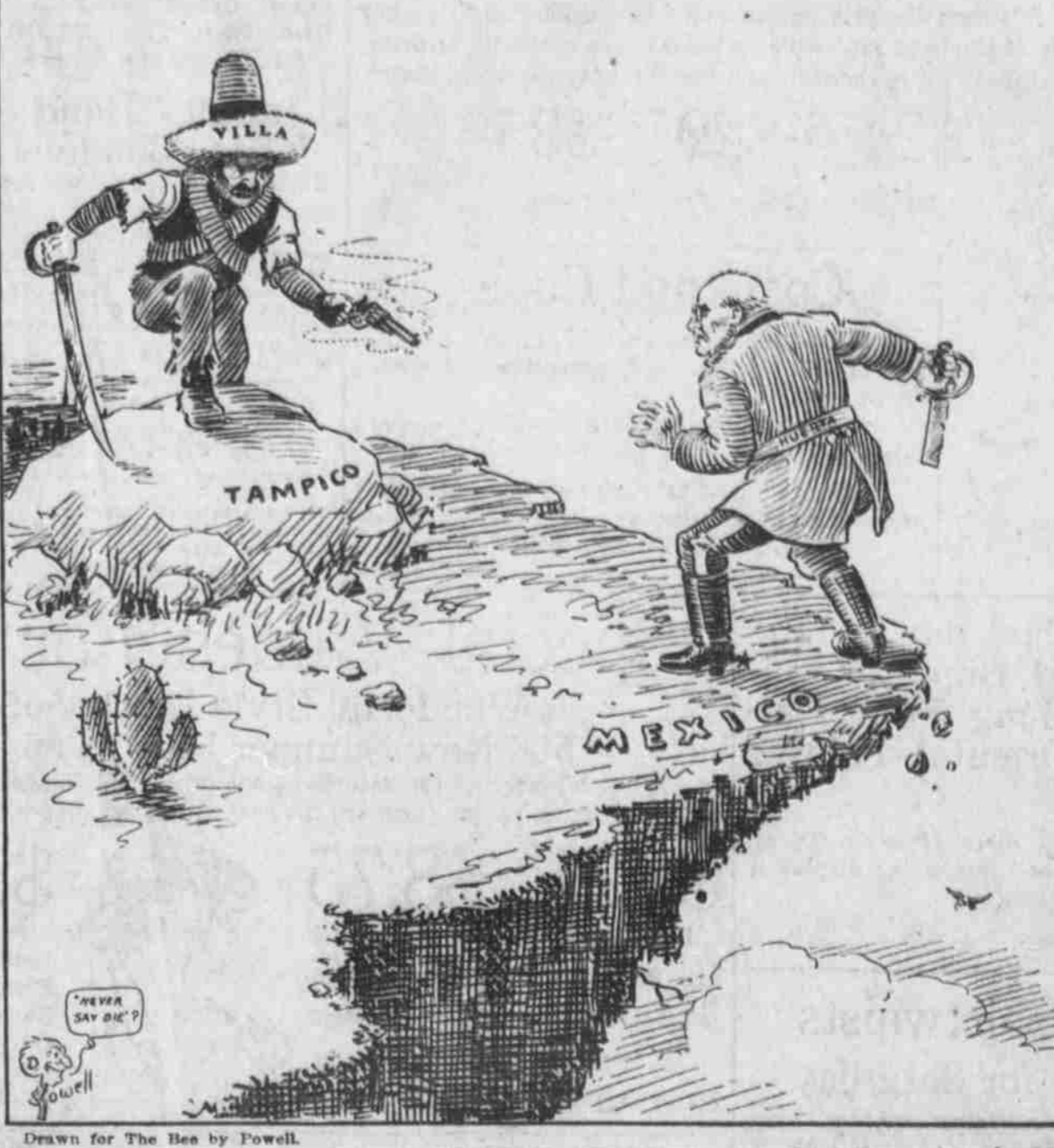
Drawn for The Bee by Powell.