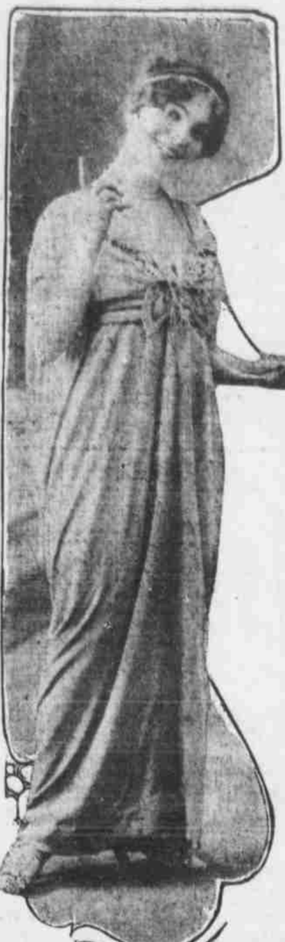
BY LA RACONTÉUSE.

Evening gowns of "Chartreuse" velvet. The skirt is simply drawn up at the center front. The left side crossing over the right one. The girle, draped, gives a high waist line. The bodice is of white net, slightly gathered at the decollete and giving a small sleeve finished by a long point, also gathered up over the arm in a strass gaiter. A butterfly bow of net embroidered with colored stones and strass trims the middle front of the bodice.