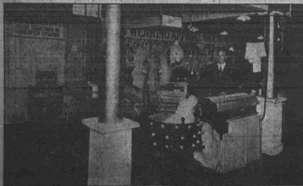
1900 Washer Co.