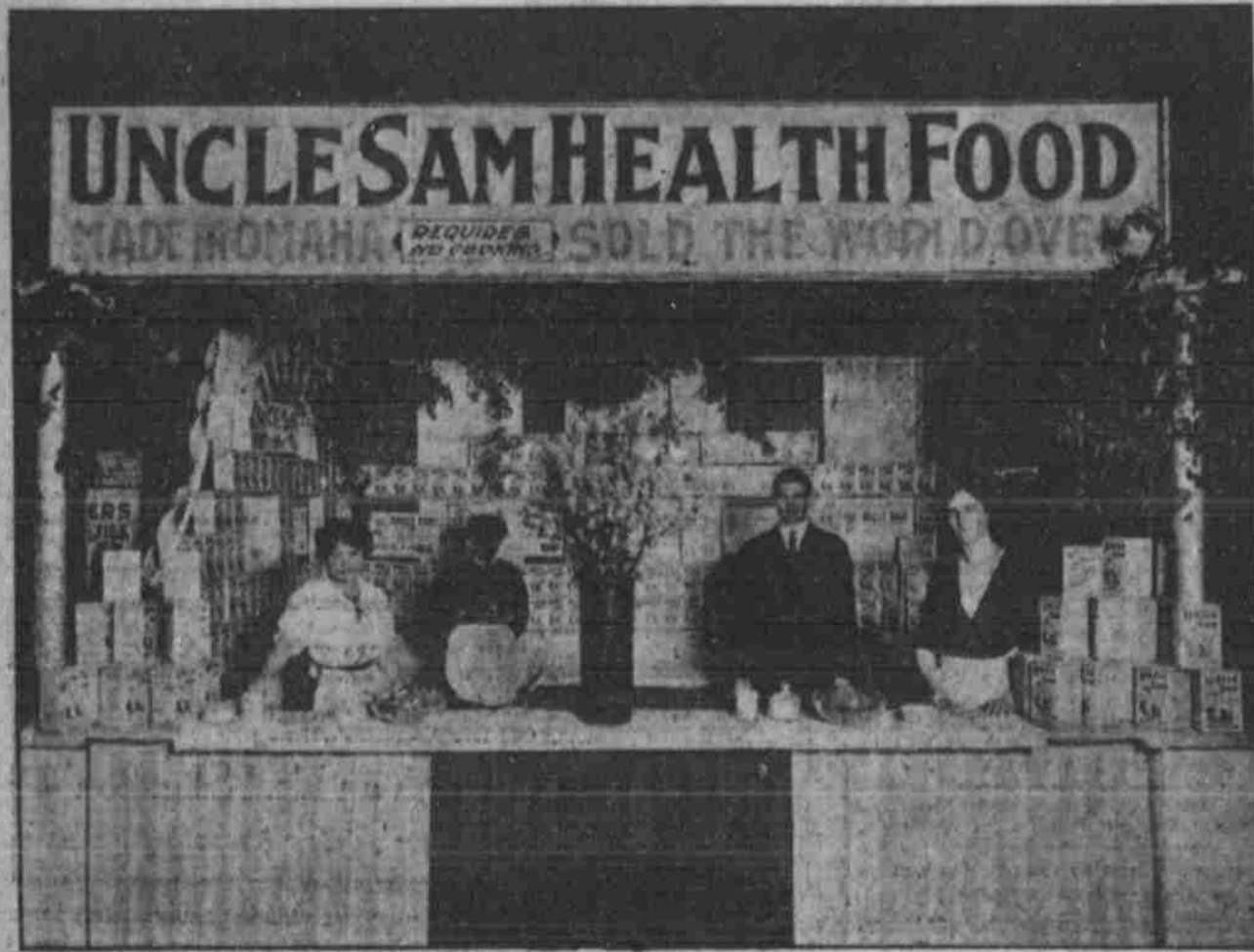
U. S. Breakfast Food Co.