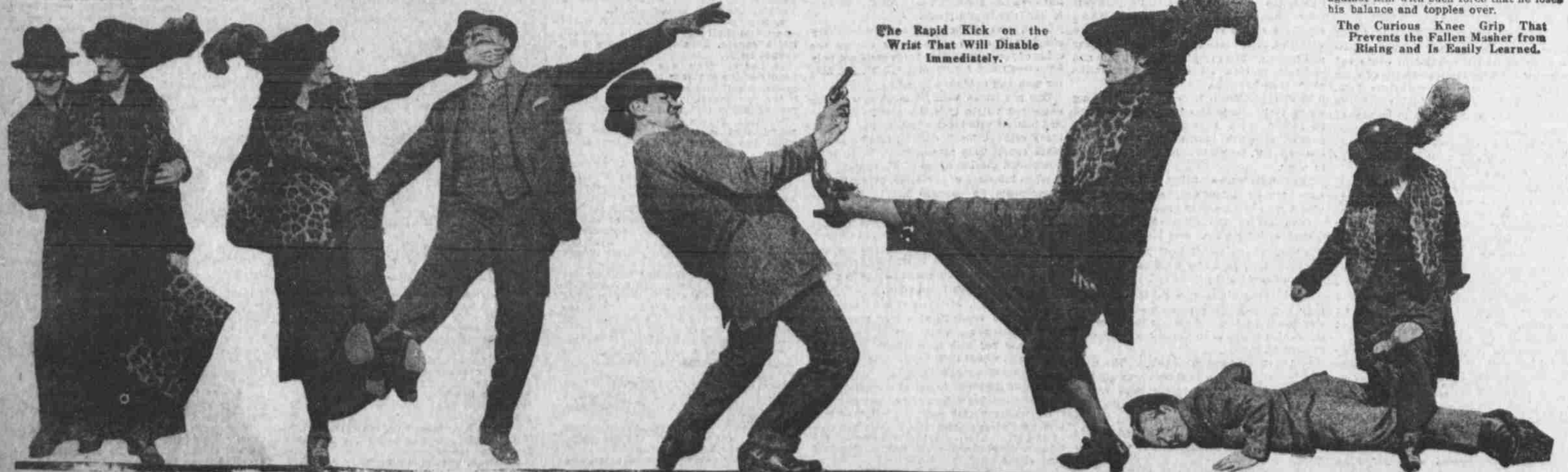
The Rapid Kick on the Wrist That Will Disable Immediately.