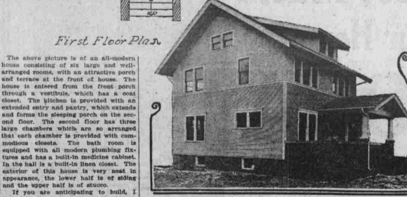
EXTERIOR OF HOUSE PLANNED BY VICTOR BECK. The above picture is of an all-modern house consisting of six large and well-arranged rooms, with an attractive porch and terrace at the front of house.