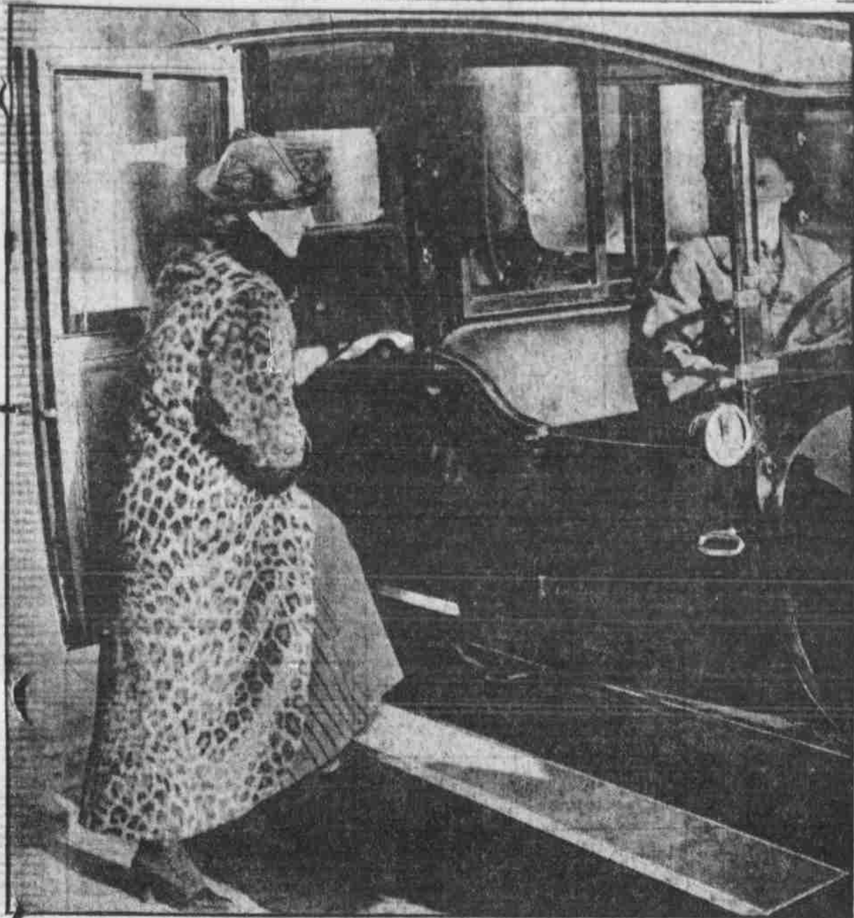
Trip in a Chandler Limousine