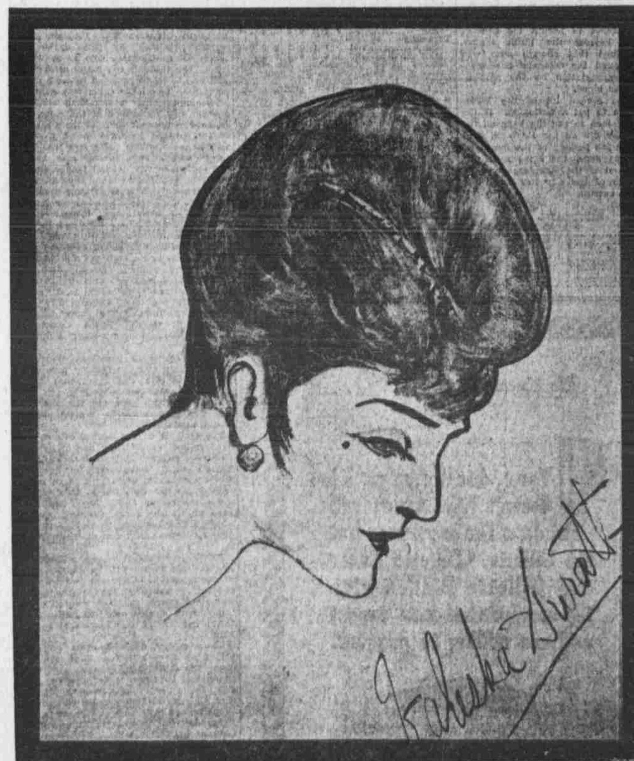
Sketch and Autograph