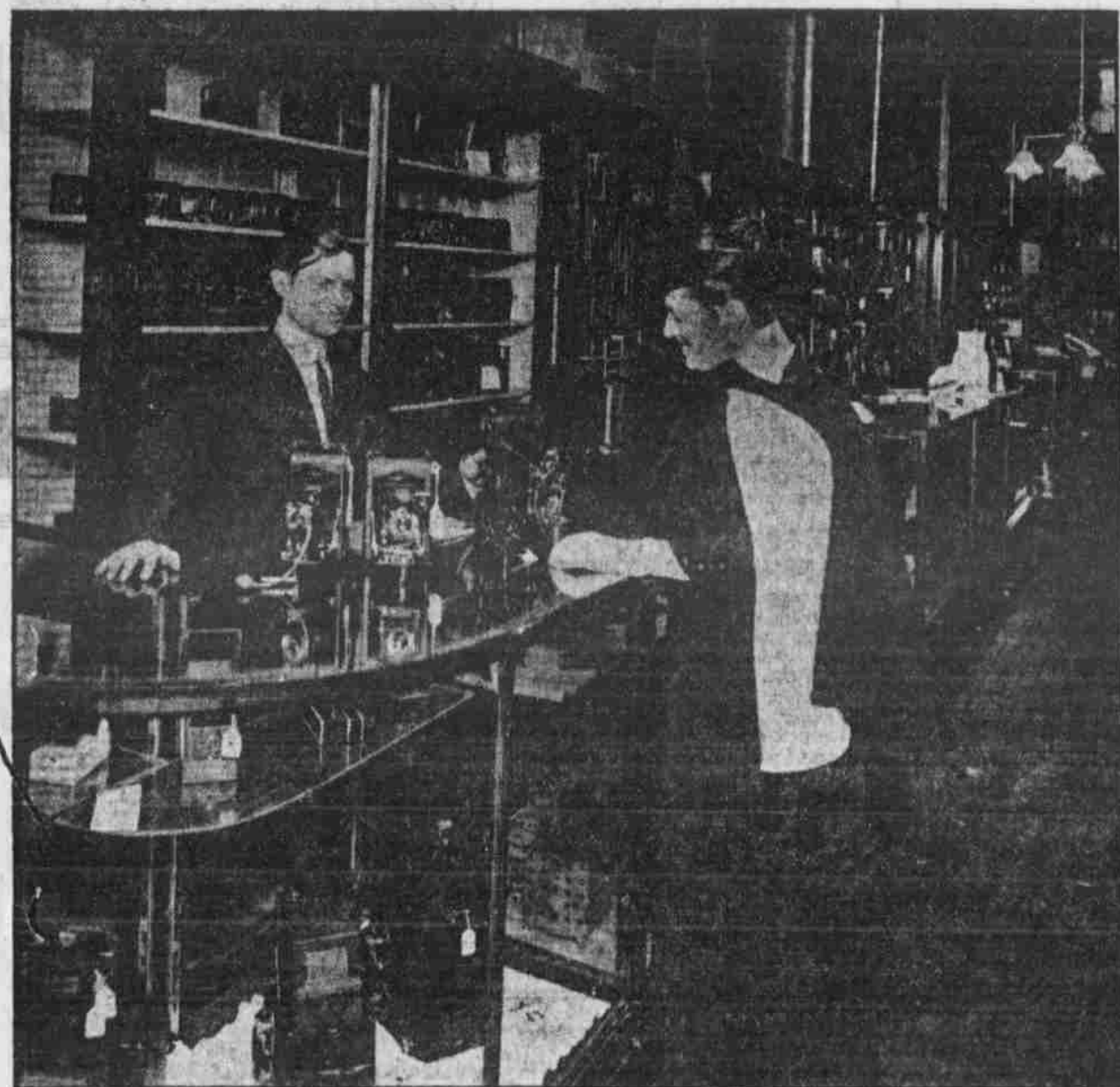
At Dempster's for a Kodak