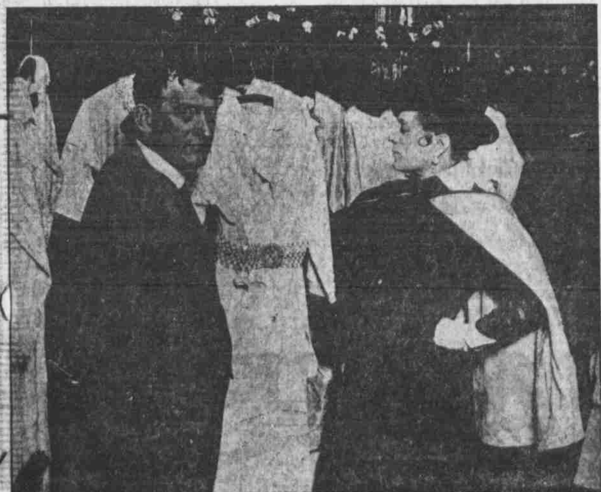
Boosts Beddeo Credit System