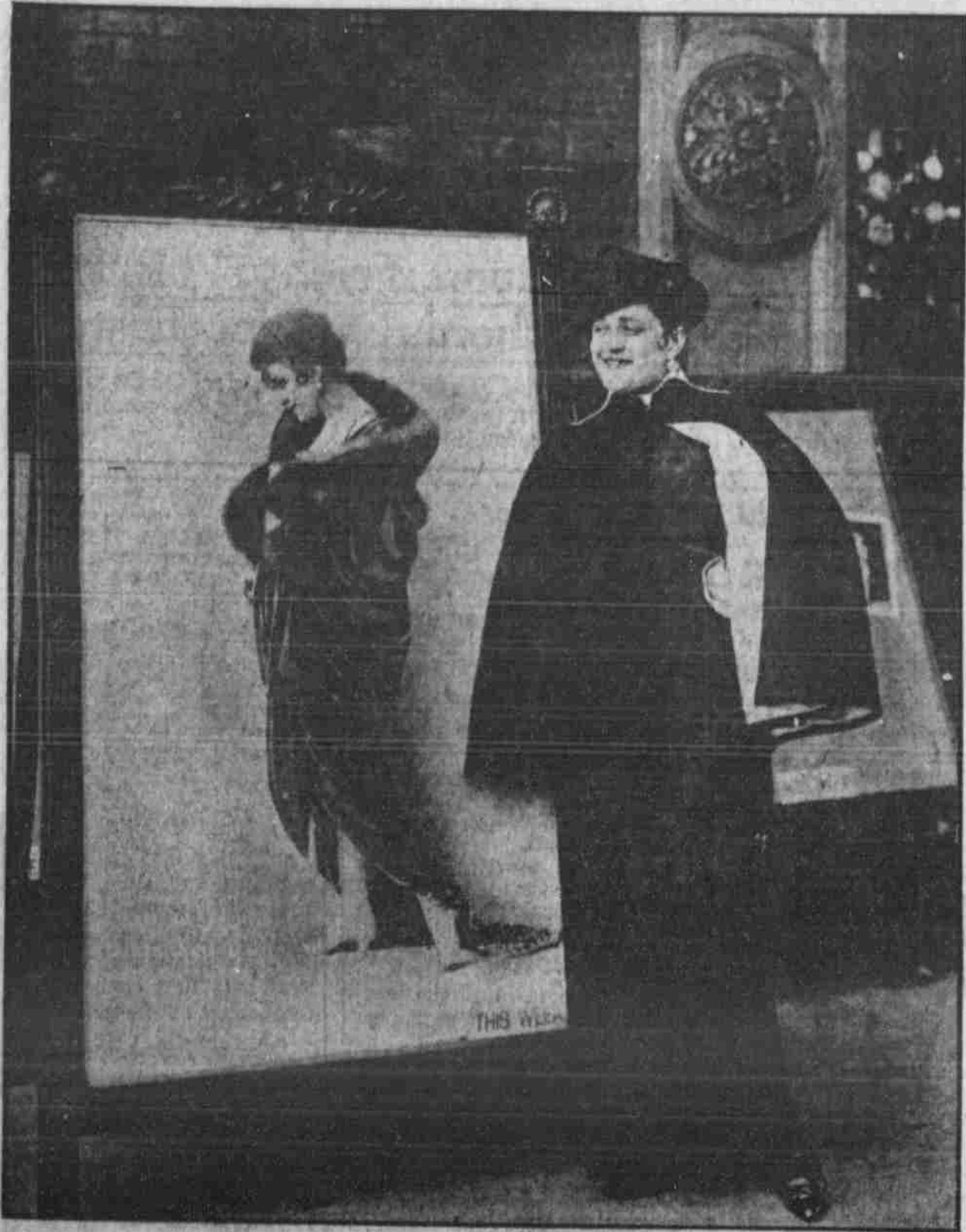
Headlining at Orpheum this Week