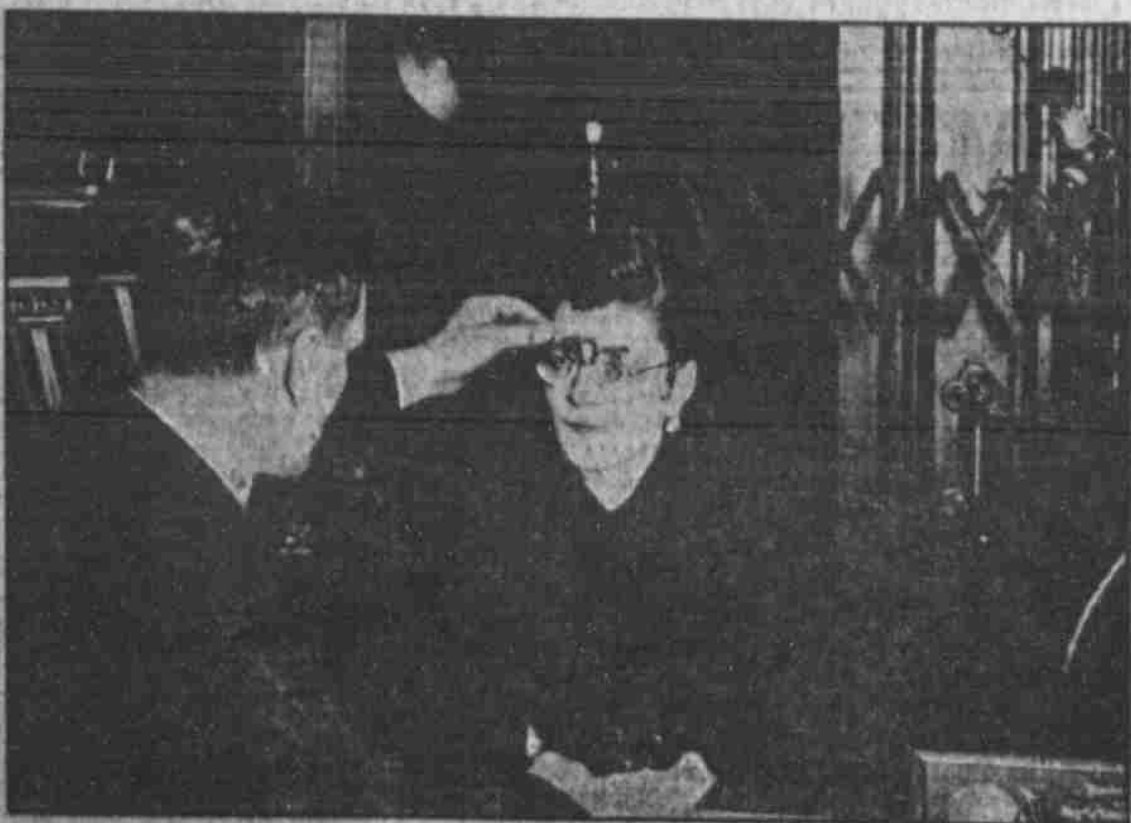
Being Fitted for Shur-On Glasses at Flitton's