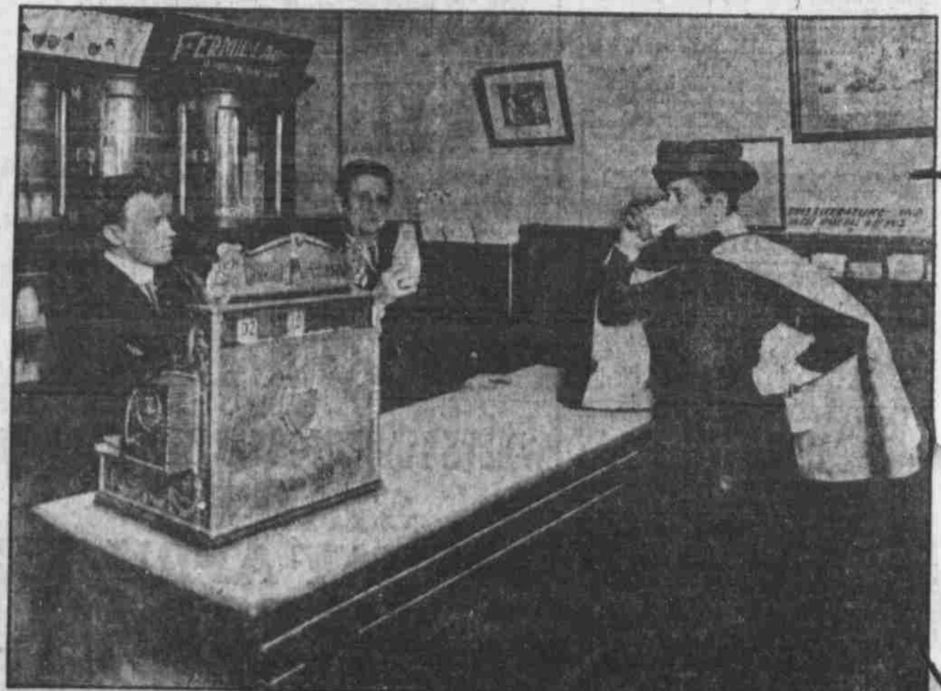
Alamito Products Make a Hit