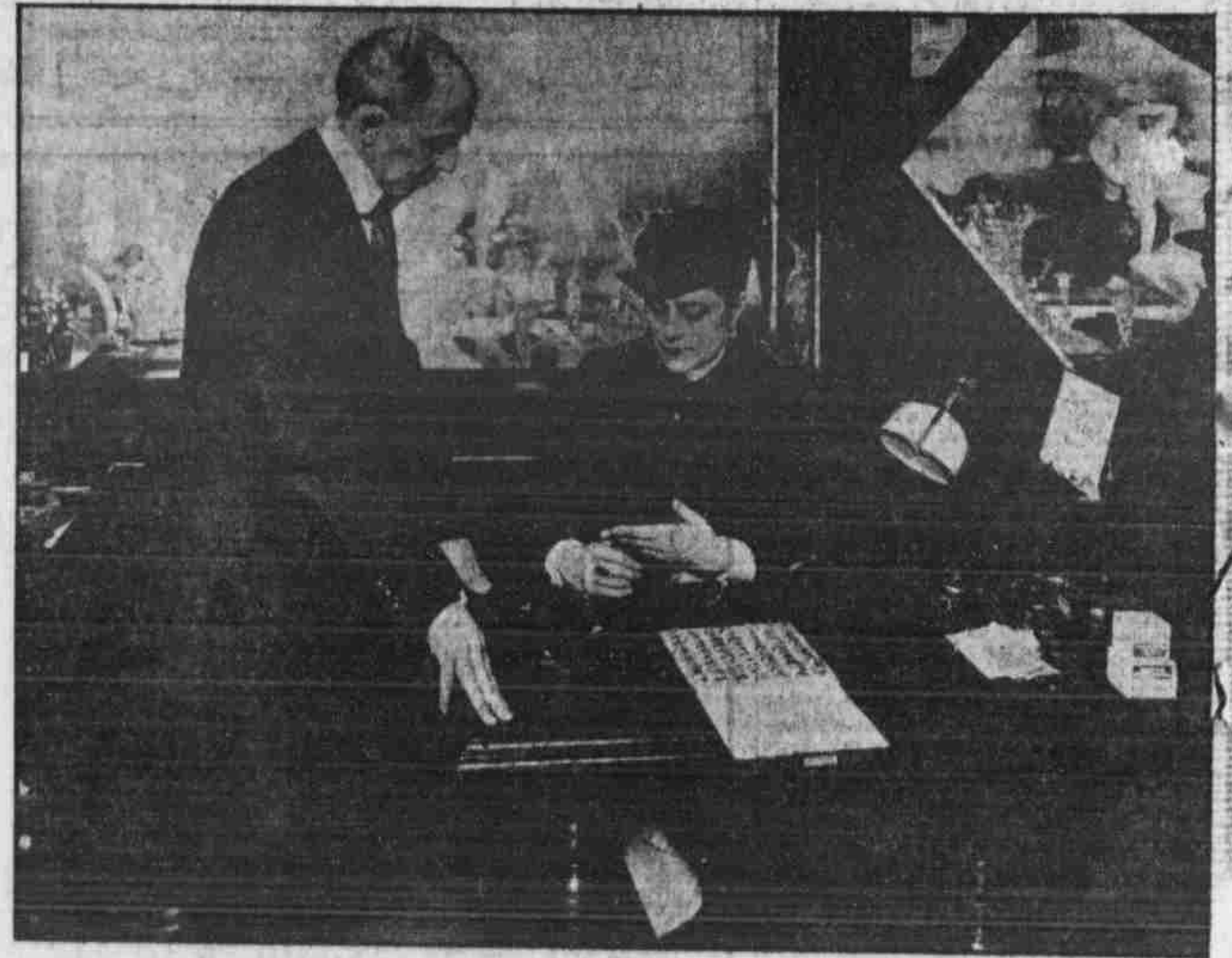
Selecting Diamonds at Combs'