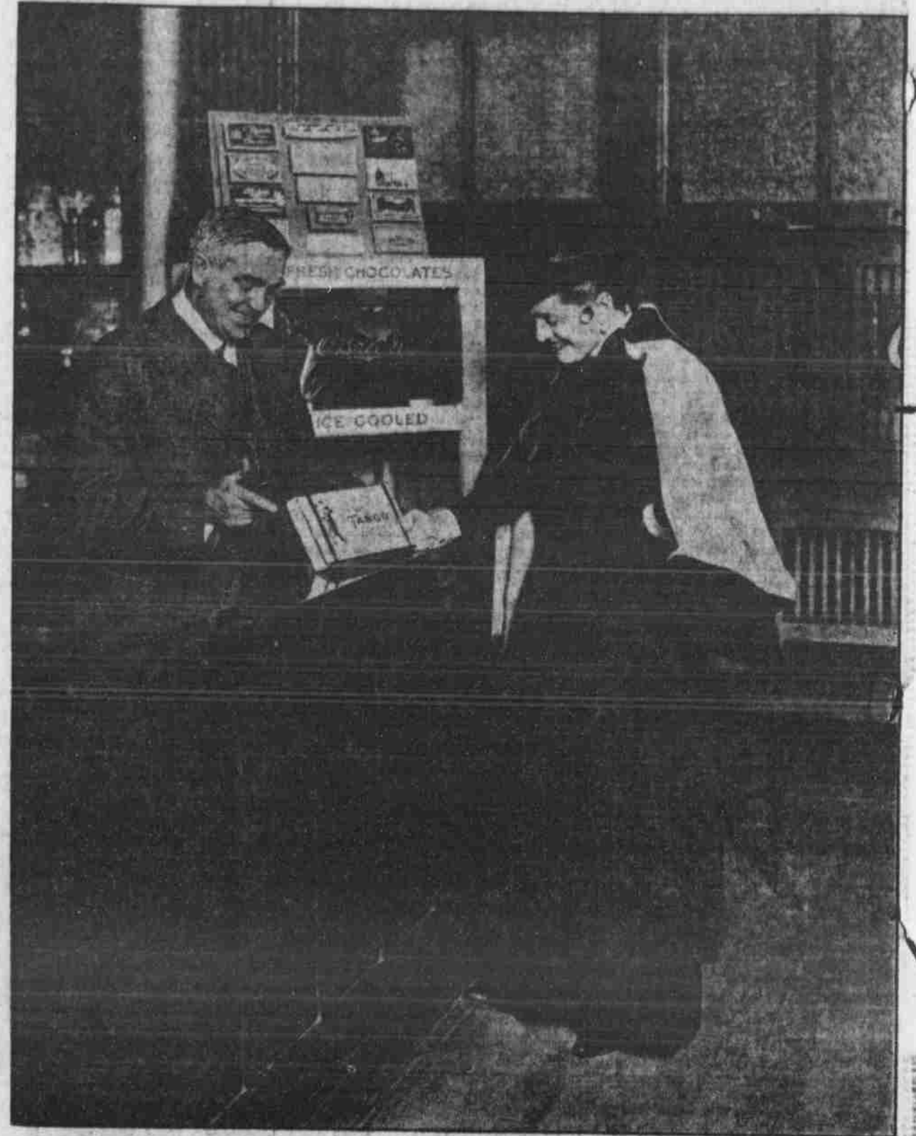
O'Brien's Candy Looks Good to Her