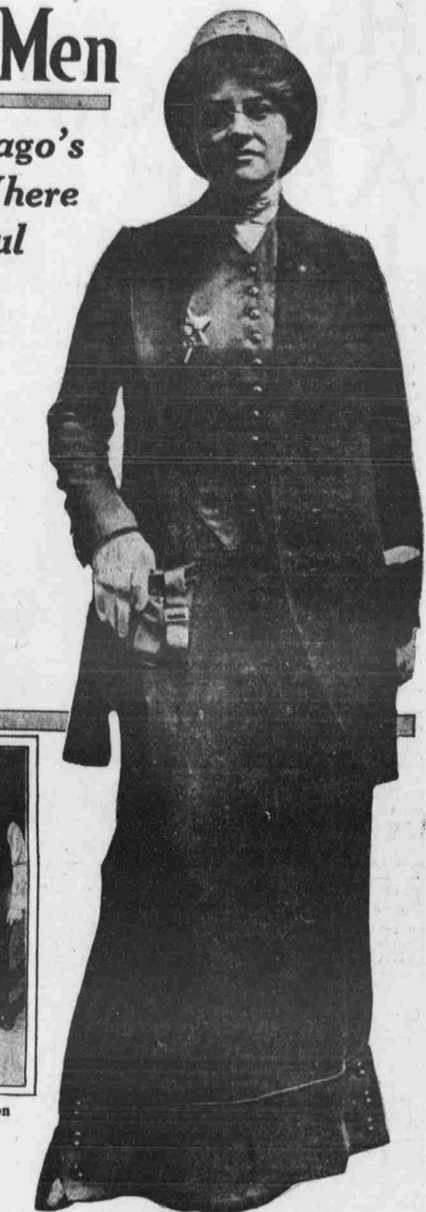
One of the Ten Chicago Policewomen on Duty in Her Regulation Uniform.

However, there still are to be found many men who will yield ready compliance with the rule of "women first" in case of shipwreck, and there is even an occasional man who will give up his seat to a woman in a crowded car. We can not so