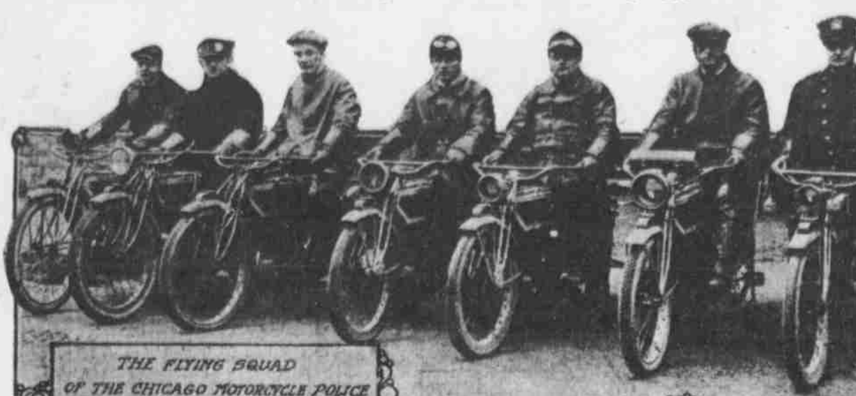
THESE MACHINES ARE EQUIPPED WITH PENNSYLVANIA TIRES