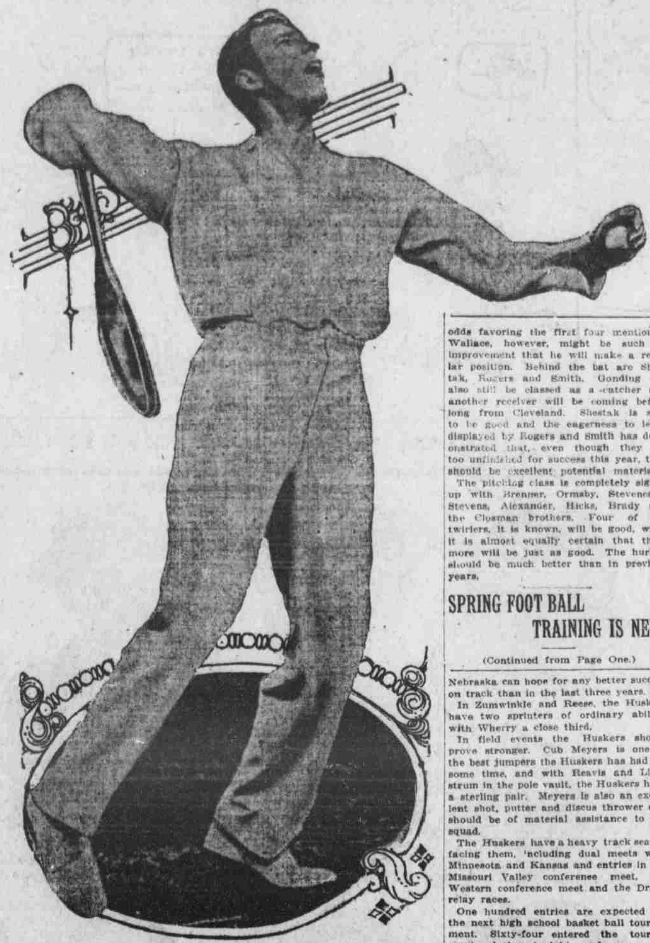
ANTHONY F. WILDING.

Maurice McLoughlin, premier American tennis player, will have an opportunity this summer to avenge the defeat administered by Anthony F. Wilding.