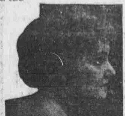
Face Made Radiant After Using Stuart's Calcium Wafers is a Beautiful Sight."

Before the blood becomes entirely impoverished it tells man of its obtaining. It warms him repeatedly. These messages are conveyed by pimples, blotches, liver spots, eczelma, tetter, rash, etc. If one disregards there symptoms one runs the risk of permanently diseasing the blood beyond hope of cure.