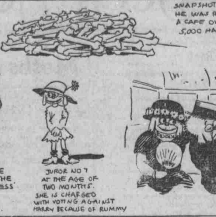
JUROR NO 7 AT THE AGE OF TWO MONTHS. SHE IS CHARGED WITH VOTING AGAINST RUMMY BECAUSE OF RUMMY