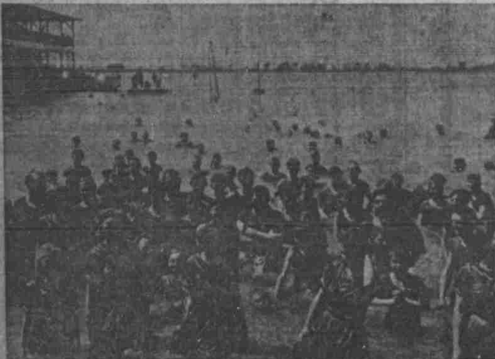
HUNDREDS ENJOY THE BATHING EACH DAY