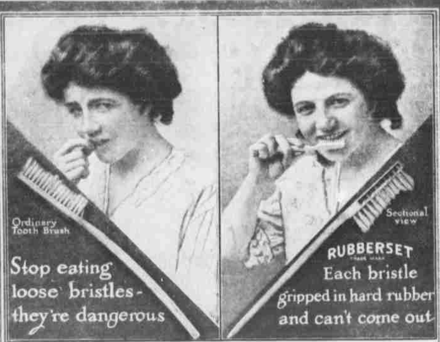
Ordinary Tooth Brush