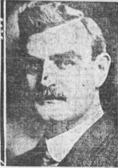
LEE HUFF. Heys Photo