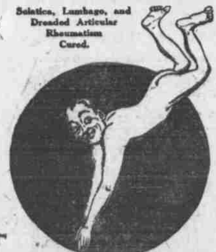
You Will Feel Like an Acrobat After Using S. S. S.

There is a host of pills, powders, tablets and what-not for rheumatism, but they all lack the first essential to but they all lack the first essential to being a natural medicine. To begin with, rheumatism is simply a name given to designate a variety of pains, and can only be reached by irri-gating the entire blood supply with a naturally assimilative antidote. True, the pains may be eased with nar-colics or the acids may be neutralized for the time being. But such methods merely temporise and do not even lead to a cure. There is but one standard to a cure. There is but one standard rheumatism remedy, and is sold in all drug stores under the name of S. S. It contains only pure vegetable elements and is absolutely free of mercury, lodide of potash or sraenic, and has proved a wonder for every form