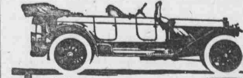
"48-Stix" Six-Passenger Torpedo—$5000