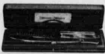
THE DURHAM-DERBY $2.50 From Your Dealer or From Us.

American Factory at Jersey City, N. J. European Factory at Sheffield, Eng.