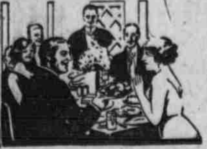
At Every Banquet You Will Always See Some Person Who is Afraid of Food.

You needn't pass up all those savory dishes just because you are afraid of what the stomach will say to them.