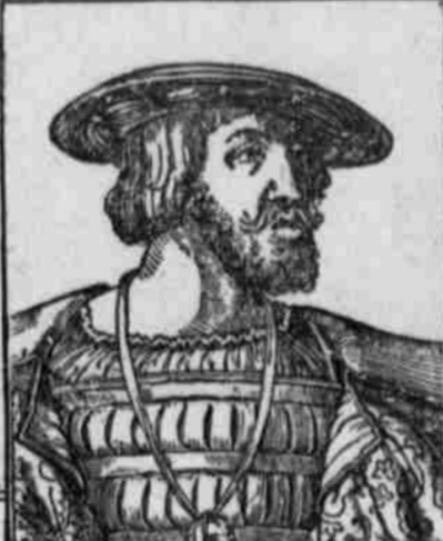
Emperor Charles V, Most Famous Monarch with the Hapsburg Lip.