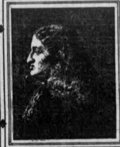
His Descendant, Charles II of Spain, Who Died in 1700, Had an Exaggerated Hapsburg Lip.