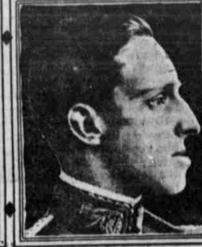
His Living Descendant, King Alfonso XIII, Who Shows the Lip Very Plainly.