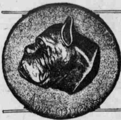
First Recorded Bulldog with Undershot Jaw. From a Print of 1625.