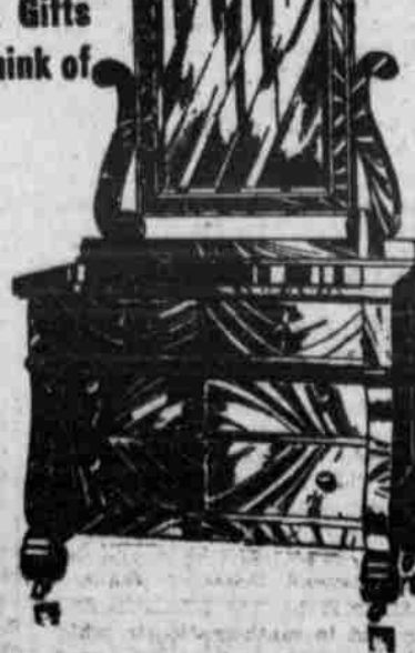
An Acceptable Gift is a DRESSER

Why not get a new Xmas? An immense line to select from. A