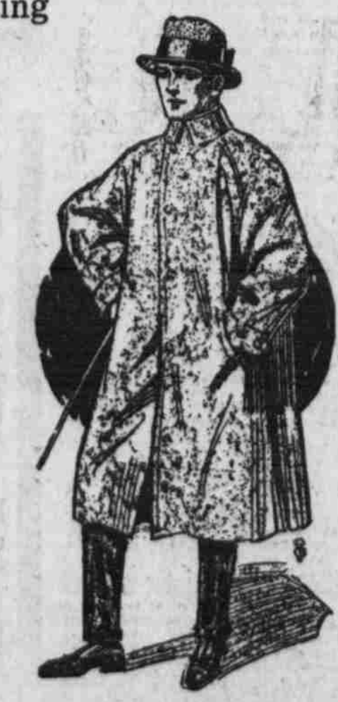
Store Closed Thursday-Thanksgiving Day