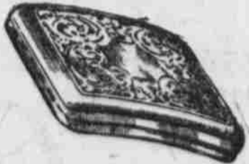
German-Silver Cigarette Case

This Cigarette Case is magnificently designed. Made to fit either the breast or hip pocket. A beautiful and useful article. Size 3 1/2" x 3 1/2".