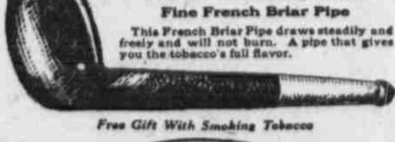
Fine French Briar Pipe

This French Briar Pipe draws steadily and freely and will not burn. A pipe that gives you the tobacco's full flavor.