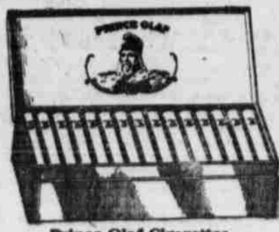
Prince Olaf Cigarettes

With a box of 100 PRINCE OLAF CIGARETTES at $1.00 we give you absolutely free 1. An Engraved German Silver Cigarette Case, conceived to fit the pocket, durable and attractive.