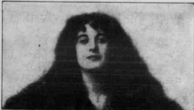
Beautiful Hair and lots of it—if you use Crystolis

$1000.00 Reward if We Fail, On Our Guarantee. Try It at Our Risk. Mail Coupon Today.