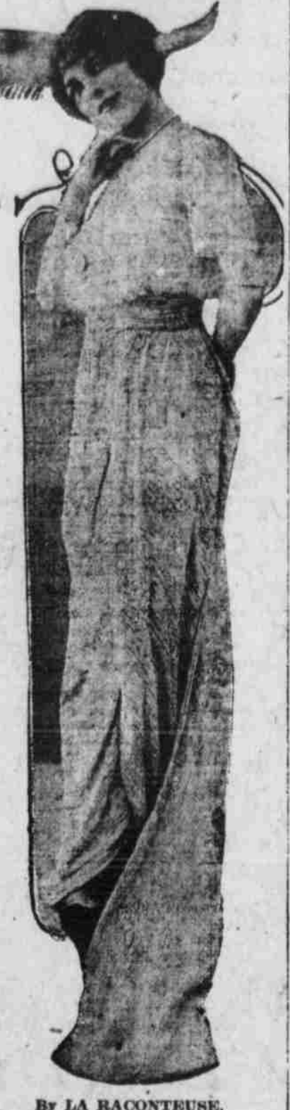
By LA RAconteuse.

Simple and effective evening gown of "crepe de chine." The small, square decollete is taken in a white plain tulle, which also makes the short and simple sleeve. A high band, embroidered with beads according to the Greek style, encircles the chest, showing in the middle front a huge embroidered flower. The lower part of the blouse is of net, held up by chaperettes of beads. Draped girde of the material. The skirt is draped in a movement crossed on the left side and shows at back a long panel, which is finished by a narrow ruffled train.