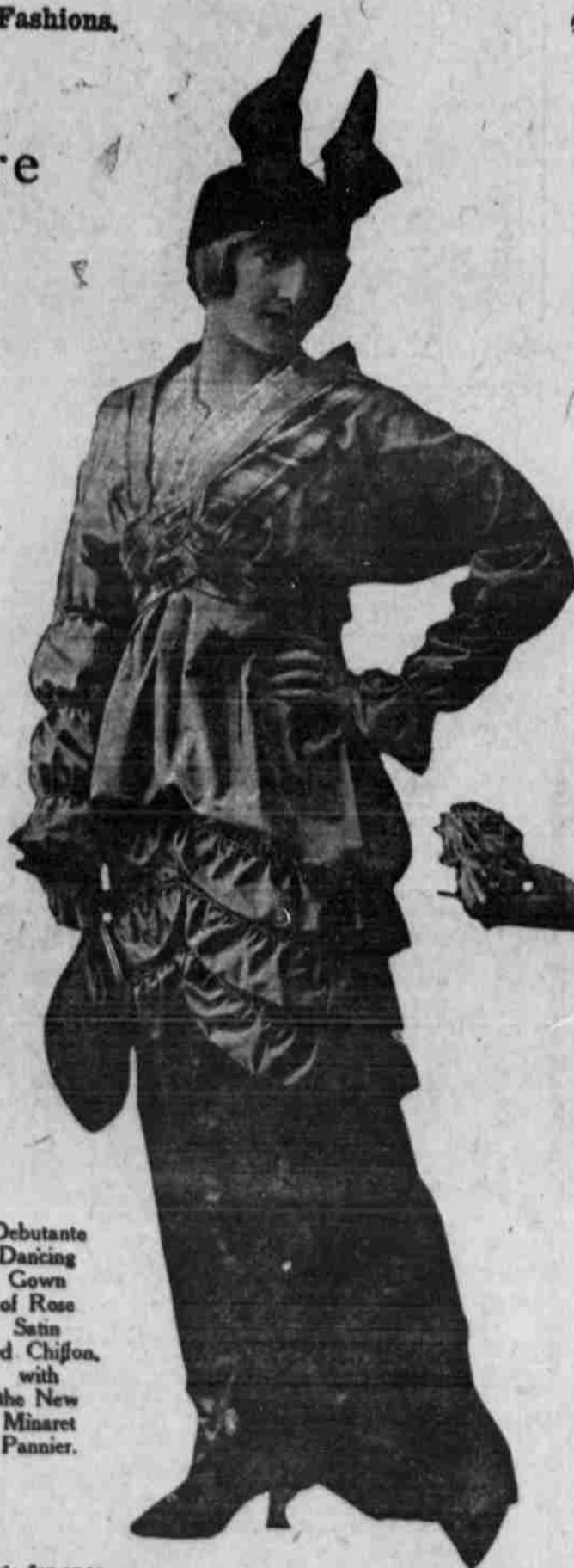
Debutante Dancing Gown of Rose Satin and Chiffon, with the New Minaret Pannier.

The muff brings the velvety moleskins into more prominence, for they are used to form the whole of the deeply pointed, loosely