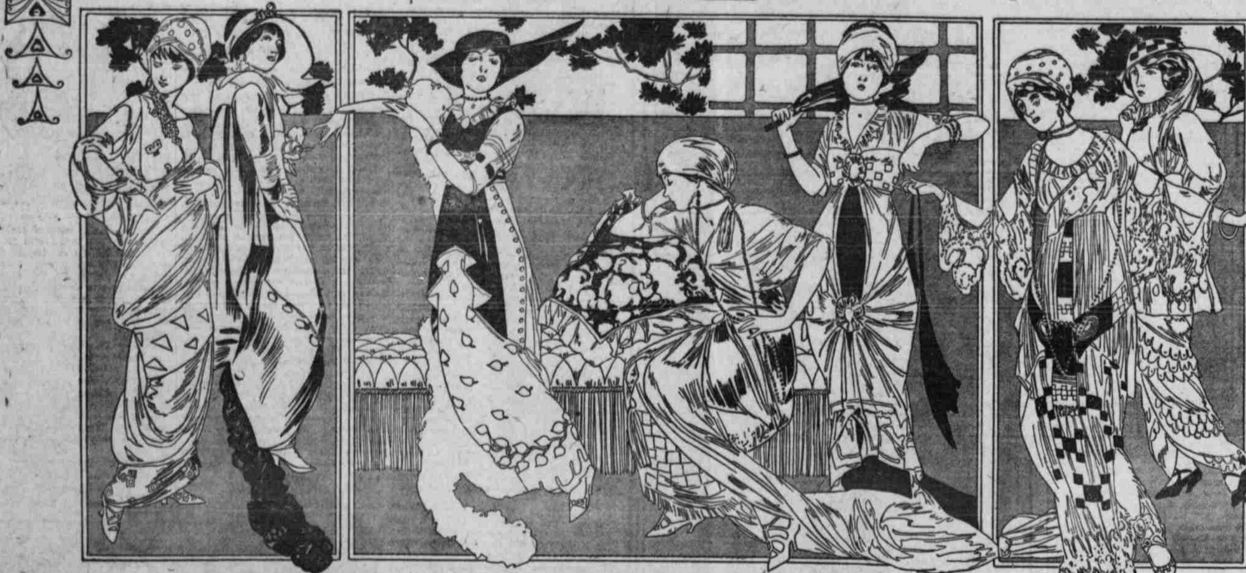
A Group of New Dresses Designed by Bakst, Reflecting the Harem Fashions.