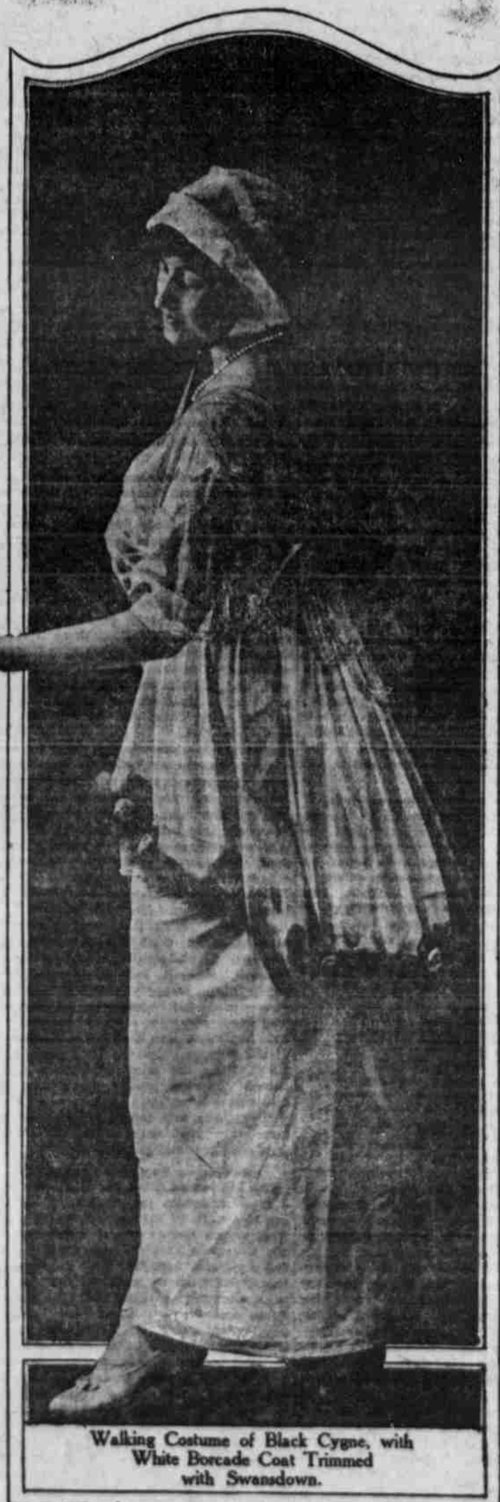
Walking Costume of Black Cygne, with White Brocade Coat Trimmed with Swansdown.

These models were shown at an opening in September. The dancing gown is the quaintest thing imaginable. It is developed in delicate rose charmeuse. The minaret tunic is of rose chiffon edged with fur that is caught in places with tiny gold rosettes. The bodice, with its interesting-