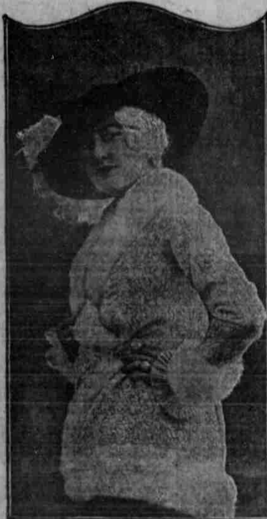
Stylish Afternoon Gown of Dull Blue Taffeta, Showing the New Over-Skirt.

Another set brings the same well contrasted furs together, but in this case the fox is tinted to a pale amber shade, while the moleskin is of the softest moss green, and the stole has for fastening and finish a big and beautiful ornament of silk cord and tassels.