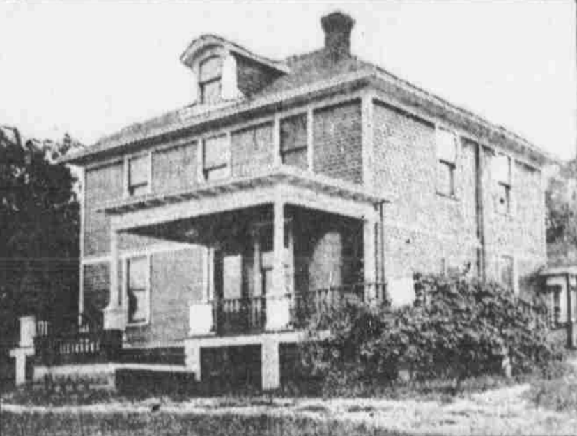
The Above Property to be Sold at