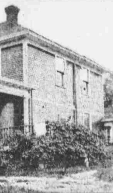
The Above Property to be Sold at