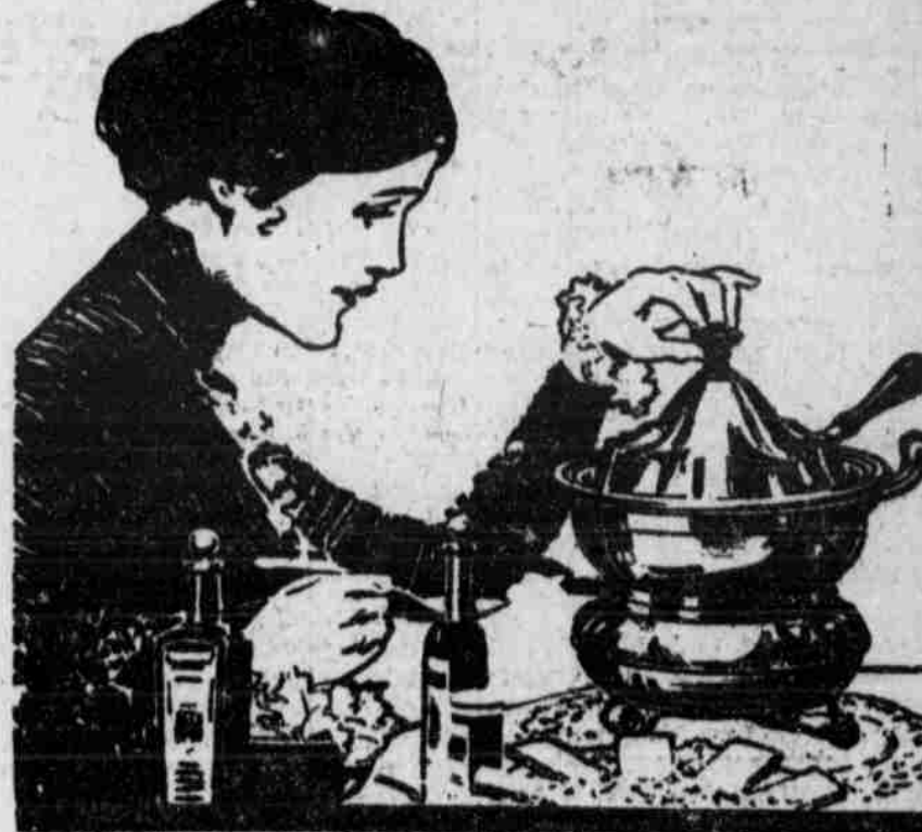
When Guests Come to Spend the Evening