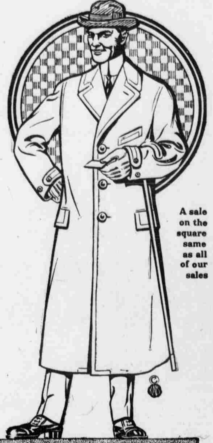
A sale on the square same as all of our sales